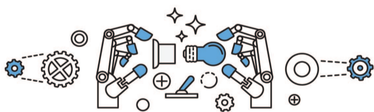
Assembly and control of the robot

In particular, partners are going to finish the production of two modules of the training programme called